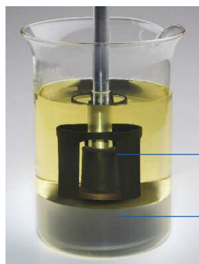
PHASE-TWO DETECTING PHASE SEPARATION

The first and only solution to continuously monitor and detect phase separation in an underground storage tank.