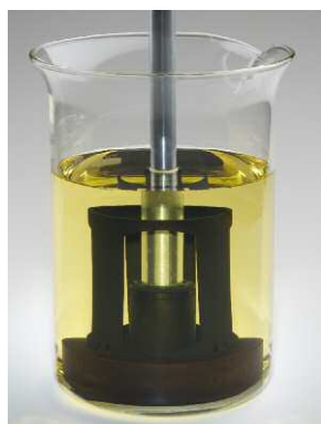
PHASE-TWO IN CLEAN GASOLINE