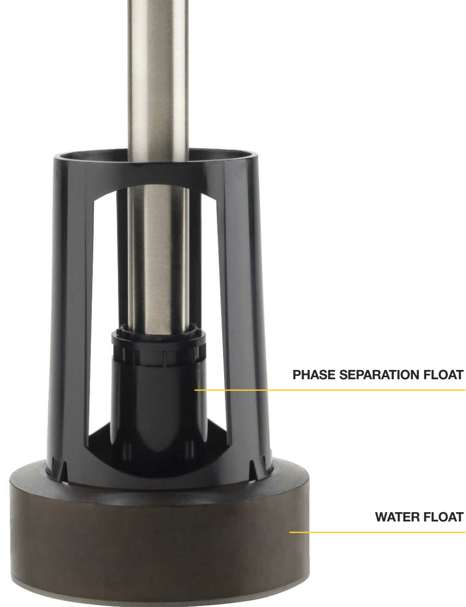
PHASE-TWO™ WATER DETECTOR