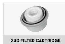
X3D FILTER CARTRIDGE