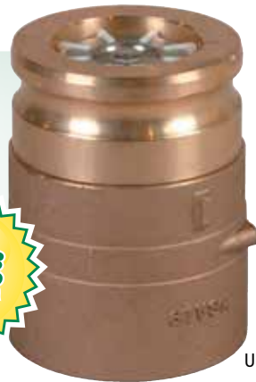
61VSA-1020-EVR USA Patent No. 5,664,951