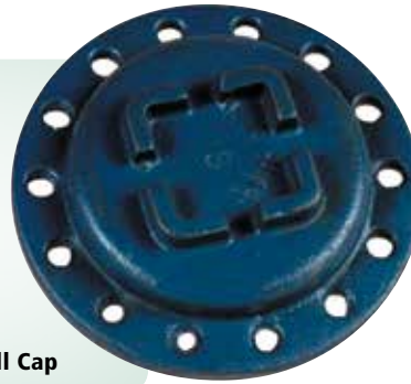
83 Fill Cap

Body: ZA alloy Cap: Cast iron Gasket: Nitrile