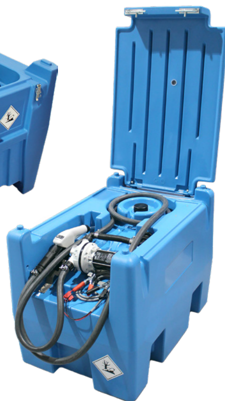
PPT 58 GALLON