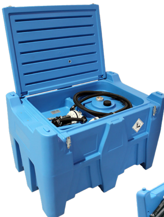
PPT 116 GALLON

For universal and durable DEF transportation and storage. The Piusi Portable Tank (PPT) offers an effective solution to deliver DEF to on-road and off-road vehicles. The PPT ensures a safe and quick DEF transfer utilizing its SuzzaraBlue DC pump. Shock resistant polyethylene construction, ventilation cap, and stainless steel accessories. The lightweight, lockable tanks, are UV resistant and can be effortlessly loaded onto your delivery vehicle. Most importantly, the SuzzaraBlue is now secured and easily accessible.