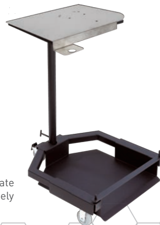
KITFR55DU *Stainless Steel Mounting Plate [KIT180MPPS] Sold Separately