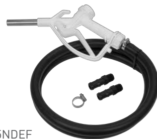
KITS05NDEF (suction hose not shown)