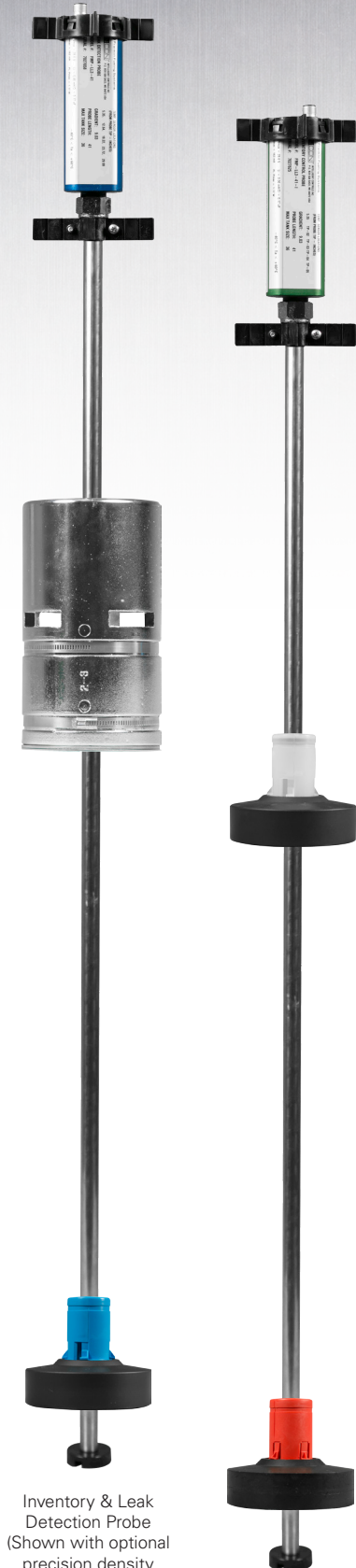
Inventory & Leak Detection Probe (Shown with optional precision density diesel float kit)